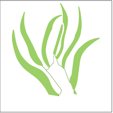
Stop #: 1 Code: 1249 Name: Green Chart: Madeira Classic 40 Stitches: 5,168 Thread used: 79.87ft

Stitches: 12,084 Height: 3.82 in Width: 3.15 in Colors: 3 Colorway: Madeira Classic 40 Zoom: 0.49