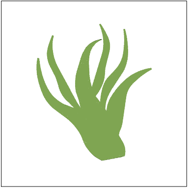
Stop #: 2 Code: 1103 Name: Chart: Madeira Classic 40 Stitches: 4,911 Thread used: 84.07ft